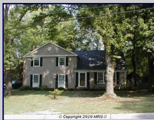
11915 Devilwood Dr Close Date 10/20 $640,000