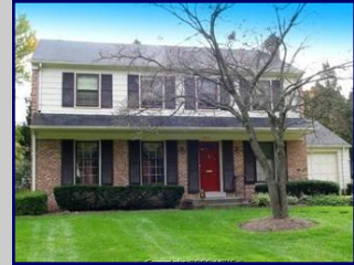
2510 Stratton Dr Close Date 2/3 $645,000