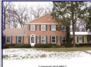
8501 Aqueduct Rd Close Date 4/19 $622,000

(from MRIS Reports) Sales Price reflects adjustment for seller-paid buyer's closing costs