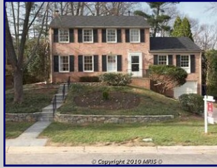
8203 Jeb Stuart Rd Close Date 5/28 $628,030