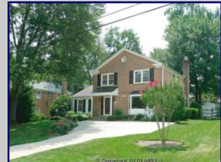
2508 Stratton Dr Close Date 11/15 $693,550