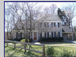
4 Atwell Ct Close Date 5/14 $730,000

Since 1978, our family has helped people move into, out of, and around the area.