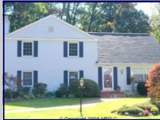
8306 Jeb Stuart Rd Close Date 1/21 $585,000