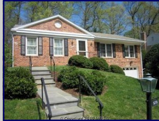
8209 Jeb Stuart Rd Close Date 5/13 $550,000