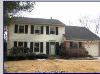
2502 Stratton Dr Close Date 6/18 $665,000