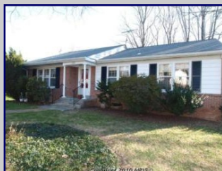
11809 Devilwood Dr Close Date 2/25 $626,000